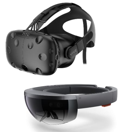
Virtual reality devices

The way of consuming and visualizing this 3D content is now evolving from standard screens to Virtual and Mixed Reality (VR/MR). However, the visualization and interaction with 6 degrees of freedom with large and complex 3D scene remains an unresolved issue in such immersive environments, especially when the scene is stored on a remote server. Two distinct bottlenecks exist: (1) the potential complexity of a 3D scene that can be displayed to the user on a VR/MR head-mounted display is substantially smaller than for a standard screen, because the GPU must generate 4 times more images (to ensure two images per frame and a sufficient frame-rate to prevent motion sickness); (2) since an increasing number of VR/MR applications consider 3D data stored on remote servers, strong latency problems may be encountered, caused by the streaming of the scene on the display device.